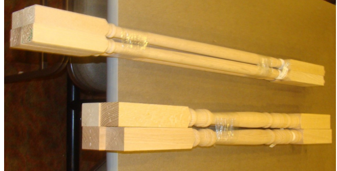
Table made by Norm Koerner, using purchased stair posts for the legs sawing off one end