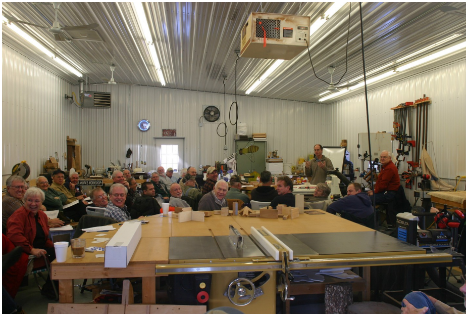
Fun moment at the event